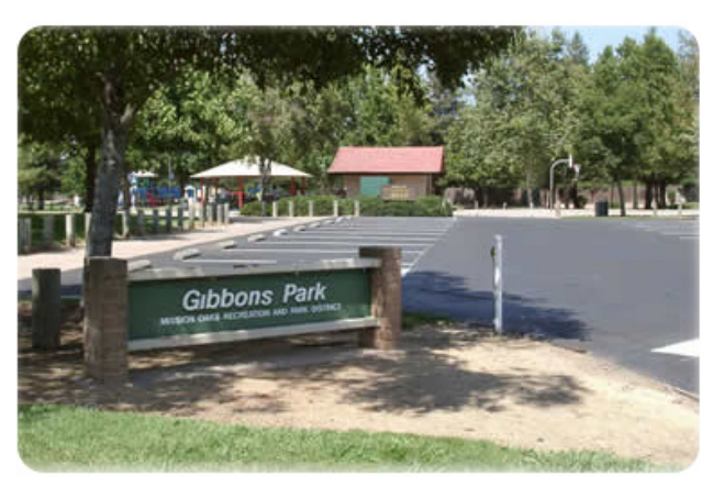
4701 Gibbons Drive • Carmichael, CA 95608 GPS Coordinates N38° 38.235 W121° 21.258 Mission Oaks Recreation and Park District